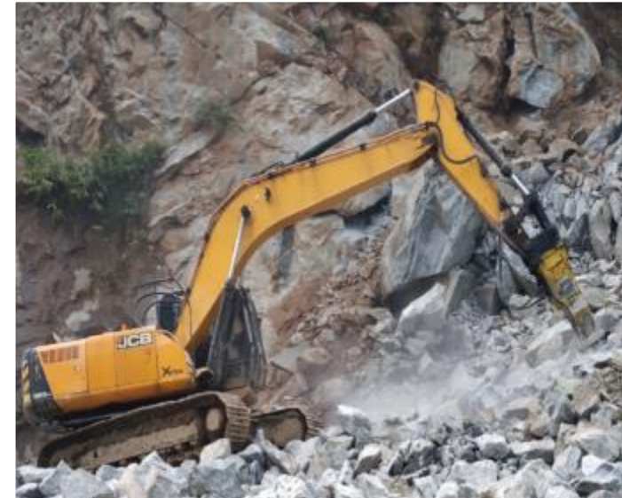
JCB JS220 Excavator

MXG 4K GENERAL DETAILS: 2.2 meters of 16 MXG 4K with spring guard are used in dynamic rock breaker application