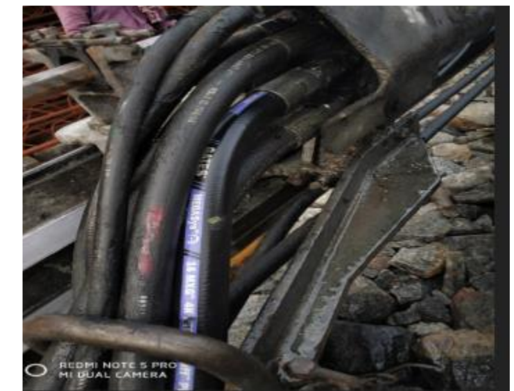
Rocket Boomer Right-Hand