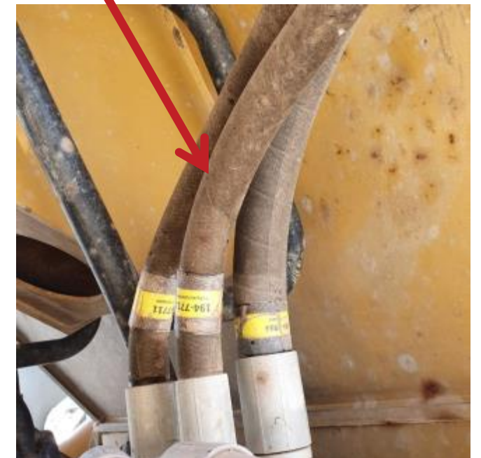
After 30 days: No wear signs