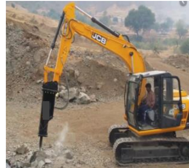
JCB JS210 Excavator

MXG 4K GENERAL DETAILS: 2.3 meters of 16 MXG 4K with spring guard are used in dynamic rock breaker application