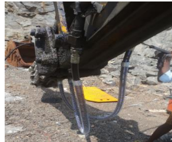
MXG Installation (LH & RH)