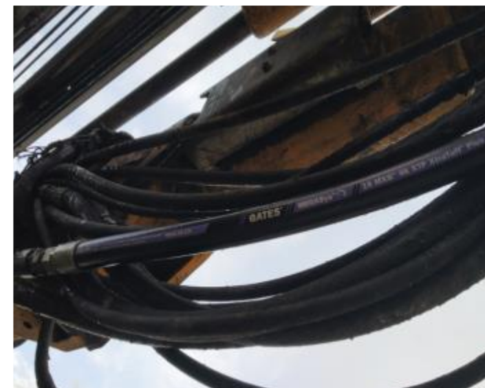
Rocket Boomer Left-Hand