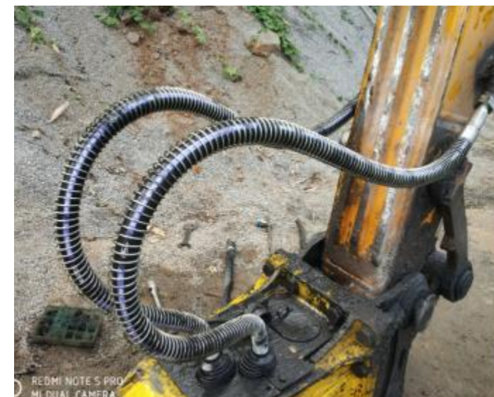
MXG Installation (LH & RH)