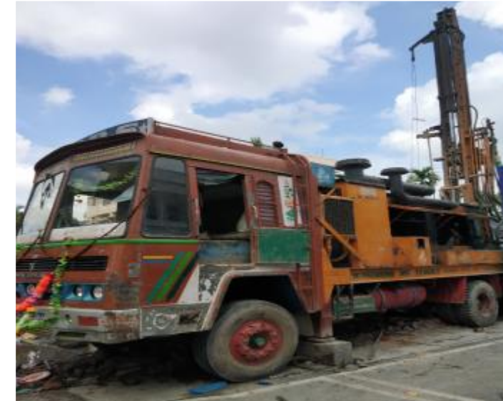
Water Well Rig

MXG 4K GENERAL DETAILS: 5 meters of 16 MXG 4K are used in dynamic traveling block in water well rig