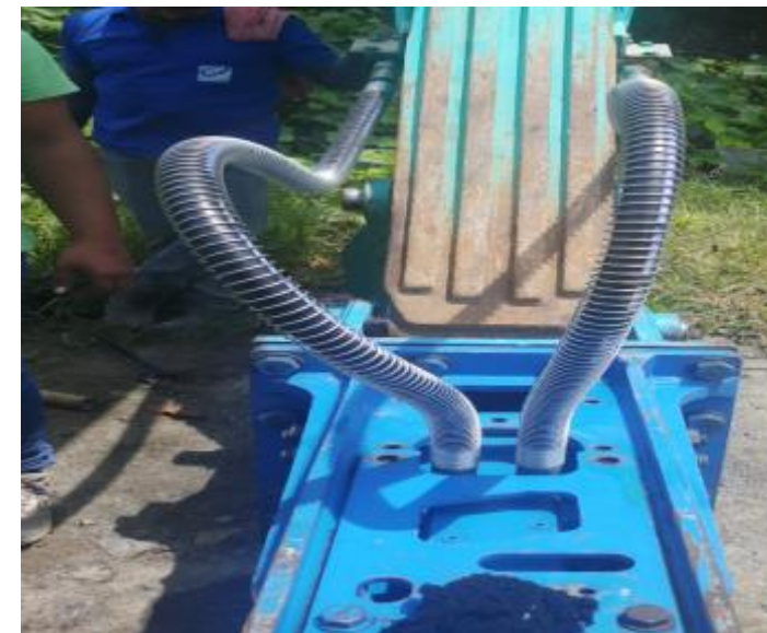
MXG Installation (LH & RH)